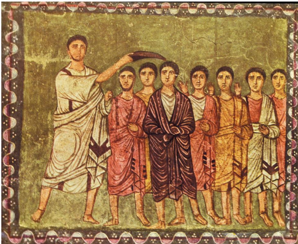
Samuel anoints David, wall painting from the Dura-Europos Synagogue, Syria. 3 rd Century