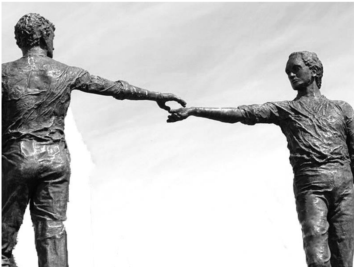
Hands Across the Divide, Derry, Northern Ireland