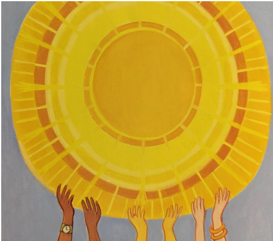
Illustration from children's book What a Wonderful World , Ashley Bryan