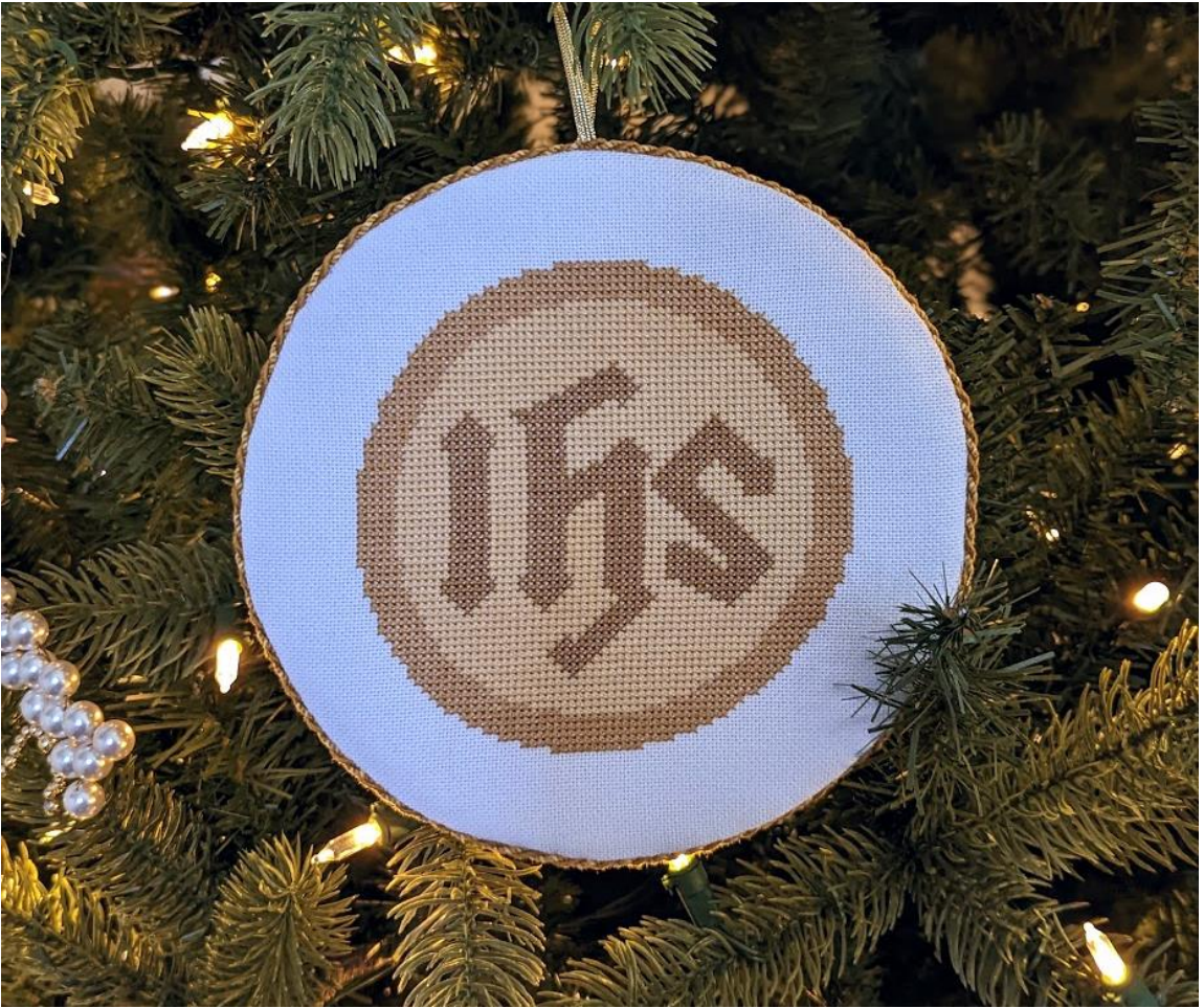
Monogram representing the Greek name ΙΗΣΟΥΣ, translated into English as Jesus .