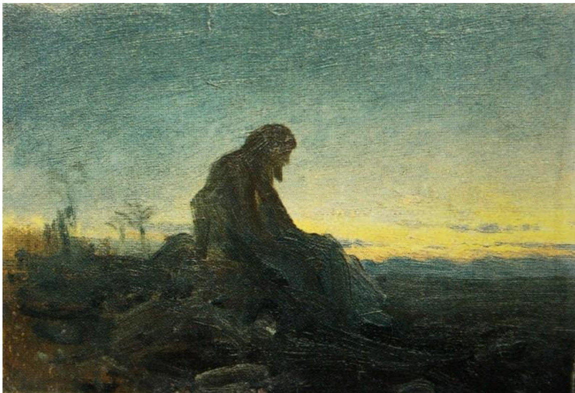
Christ in the Wilderness, Ivan Nikoleavich Kramskoy