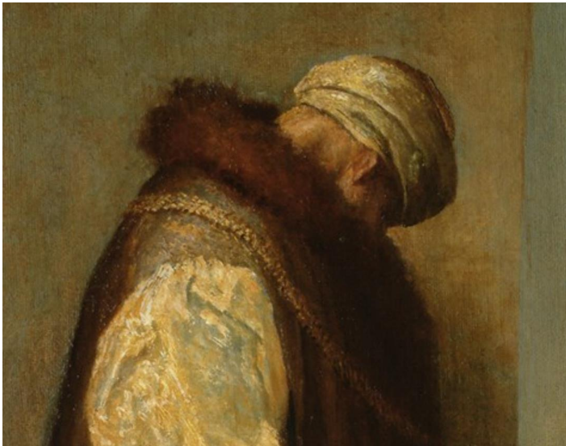
For He Had Great Possessions , George Frederic Watts, 1894