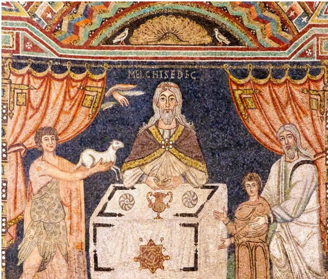
7 th Century Mosaic of Abraham, Abel, and Melchisedek at the Basilica of Sant'Apollinare in Classe, Ravenna, Italy