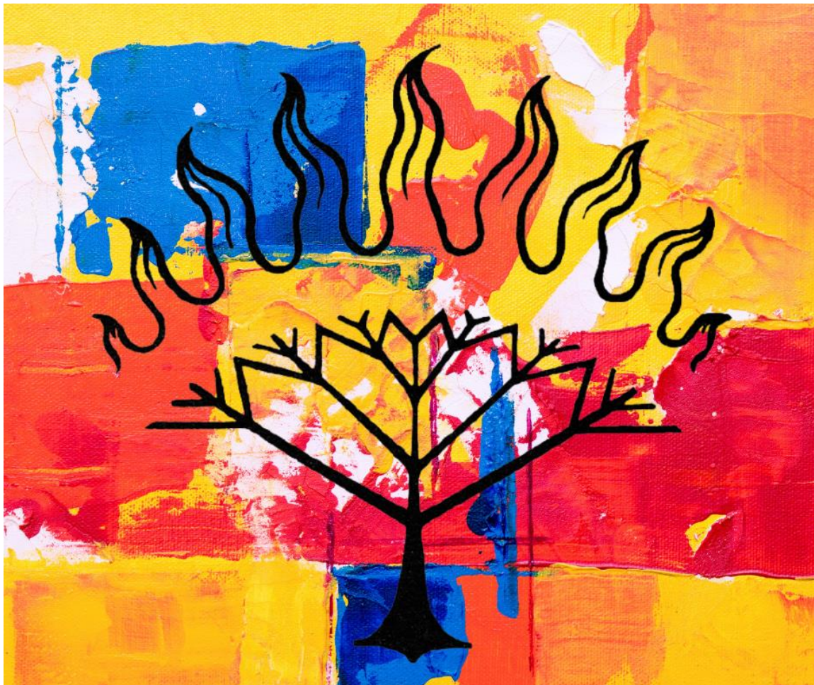
Burning bush image from the seal of the United Presbyterian Church in the USA, 1958-1983